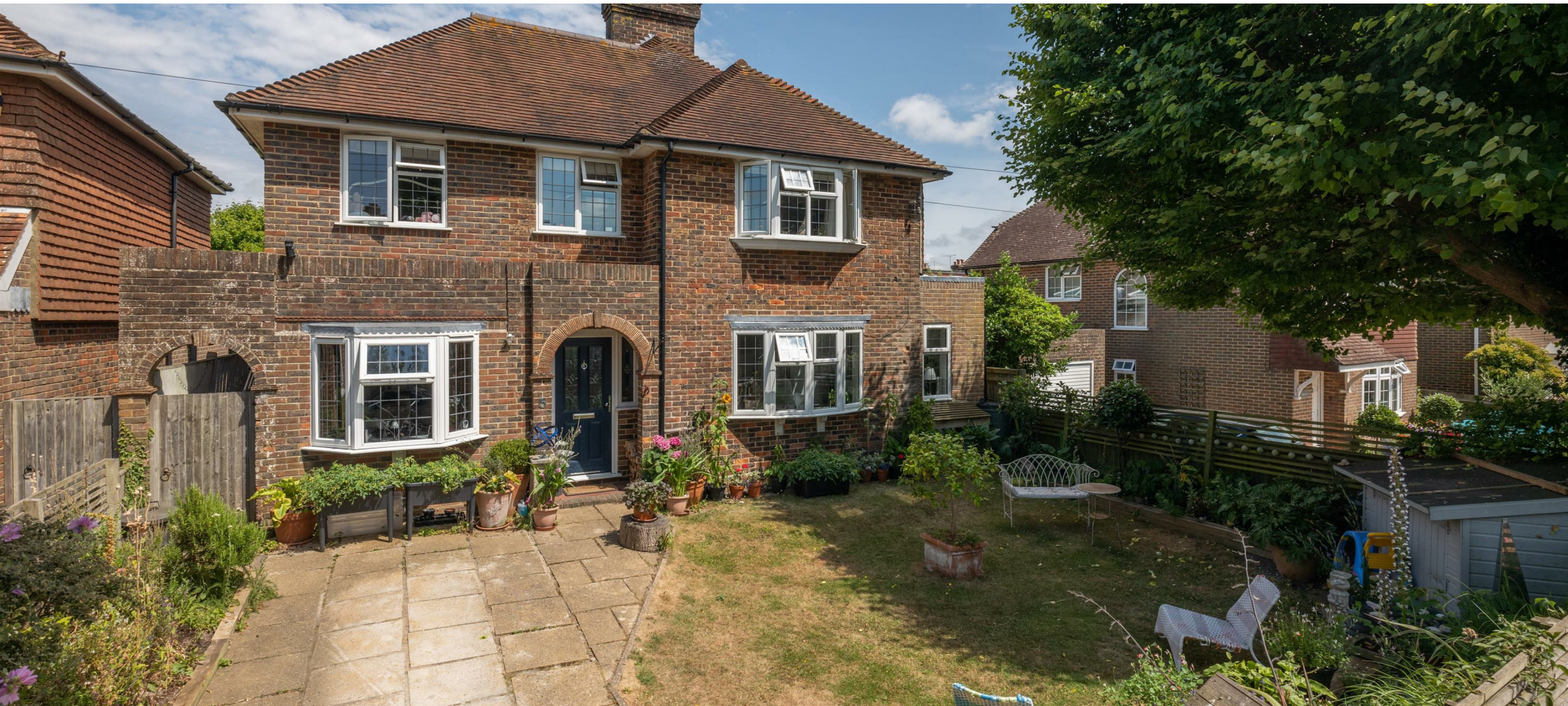
Ferrers Road, Lewes